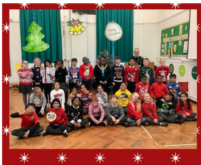
The Mayor of Barking and Dagenham visiting the school on Christmas Jumper Day (7th December)