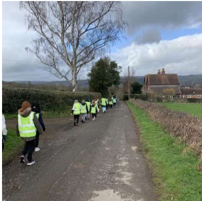
The children leave Trewern after a wonderful week

The staff at Trewern were very impressed by the children and said that as a school we “smashed it out of the park.”